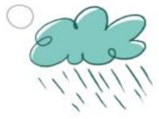
4 air temperature